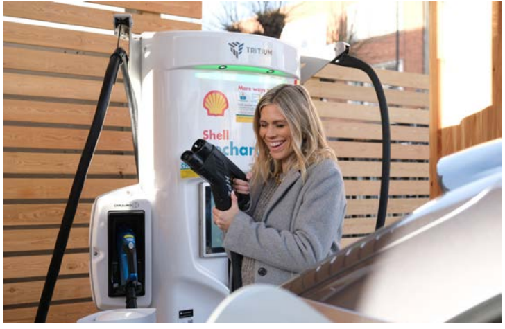
East-to-use rapid chargers like these new 175kW units at the Shell Recharge hub in London can recharge your electric car within minutes

The most common rapid chargers in the UK are 50kW units, with thousands dotted around the network. A Volkswagen ID.3 48kWh will take around 45 minutes to charge from 10 to 80 percent with one of these. Finally, we have what are called destination posts. They're often found in public car parks, supermarkets and workplaces. You'd usually use one of these points if you're planning to be away from your car for a few hours. So if you're at work or doing a spot of retail therapy, these are perfect. These use an AC connector, so make sure you have your cables with you.