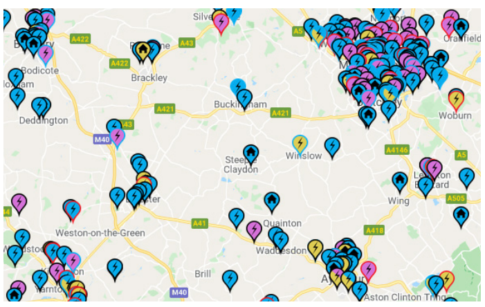
Smartphone apps such as Zap-Map.com will show you the location of your nearest charger and can also tell you whether it's available. You can also filter results for charger speed and network

Wondering where to charge an electric car? Basically, anywhere there's electricity! But if you can park off-street at home, most of the time you'll use your home charger, which is great as it means your car is filling up whilst you're sleeping. But if you are planning a longer trip, or don't have access to off-street parking at home, you'll need to do a little research.