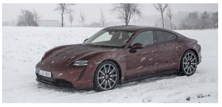
Electric car batteries hate the cold. Make sure you have enough charge in your battery so the car can keep the pack warm when the temps drop

To prevent damage to your battery pack, most electric cars are equipped with battery management systems that can heat or cool a pack if the system thinks that damage may occur. To do this, it needs to have charge in the battery. So if you've got home with zero miles of range left, 2% showing on the battery and you haven't plugged in, the management system won't have the juice to keep your battery at a healthy temperature.