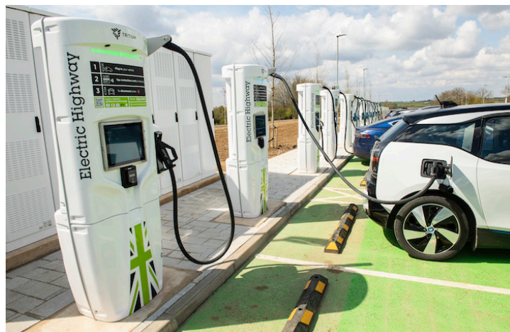
Rapid chargers like these new 350kW units at the Electric Highway charging hub on the M6 can recharge your electric car within minutes

The most common rapid chargers in the UK are 50kW units, with thousands dotted around the network. A Volkswagen ID.3 48kWh will take around 45 minutes to charge from 10 to 80 percent with one of these. Finally, we have what are called destination posts. They're often found in public car parks, supermarkets and workplaces. You'd usually use one of these points if you're planning to be away from your car for a few hours. So if you're at work or doing a spot of retail therapy, these are perfect. These use an AC connector, so make sure you have your cables with you.