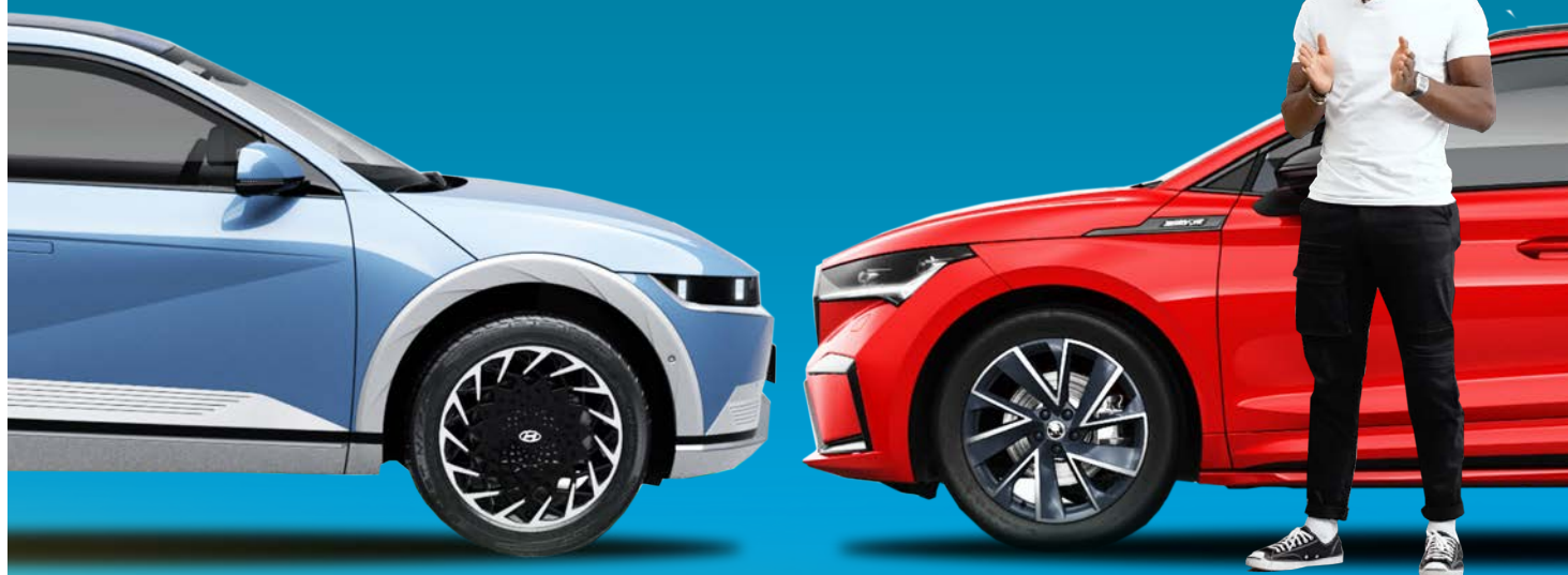
The latest generation of electric cars can charge at high speeds and offer long ranges in excess of 250 miles

If you can find a location that has two or more units (increasingly common now), head there first. Even if one unit is offline or being used, your odds of success are far greater. Double or quad unit sites are also generally much newer and generally more reliable. If you are planning to charge at your destination, such as a hotel or shopping centre, check the website just to make sure the points are still working and haven't been dug up.