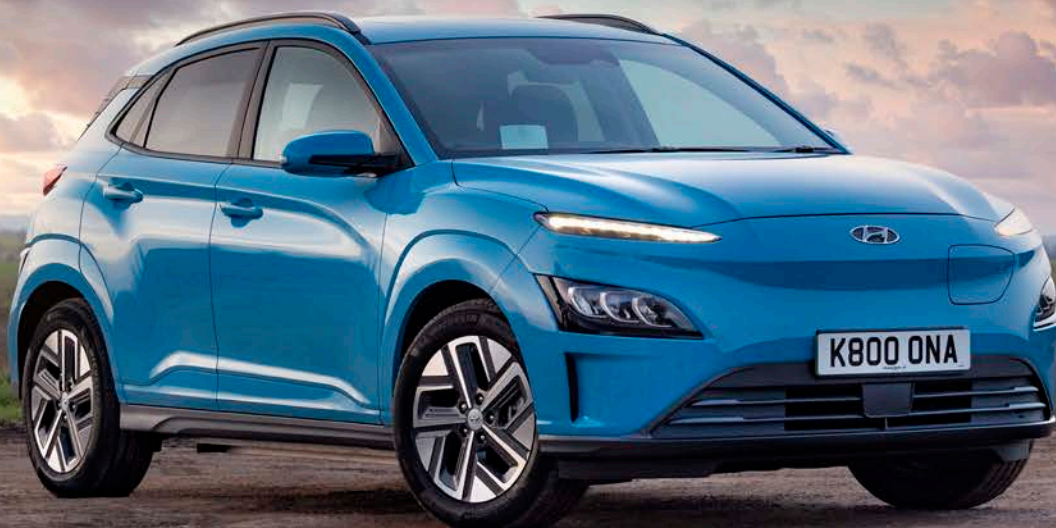
A Hyundai Kona Electric is a popular choice for first-time electric car buyers. It comes with a great battery range and is very simple to drive

An average electric car, such as the Renault Zoe, has a 52kWh battery, so would be capable (in theory) of powering the heater for 52 hours. Instead it is used to power a motor which will take the Zoe for 242 miles. That means it uses 0.21kWh per mile – which is its measure of efficiency, in a similar way to miles per gallon in a petrol car. The kW can also indicate how fast a car will charge and how much it will cost. In its simplest terms, compare a 2kW 'granny charger' to a 150kW rapid charger and you can guess how long it will take to fill a 100kWh battery. If you are paying 14p per kWh for your electricity at home, a full charge of 50kWh on your Zoe will cost you £0.14 \times 50 = £7 .